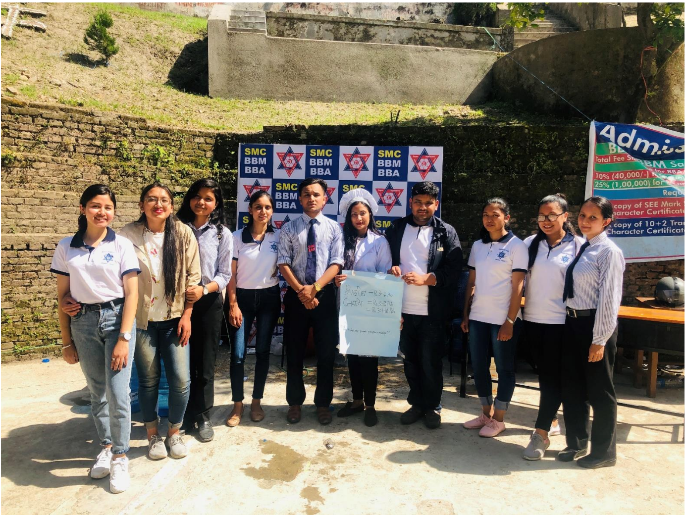
Food stall at SMC, May 17 2019